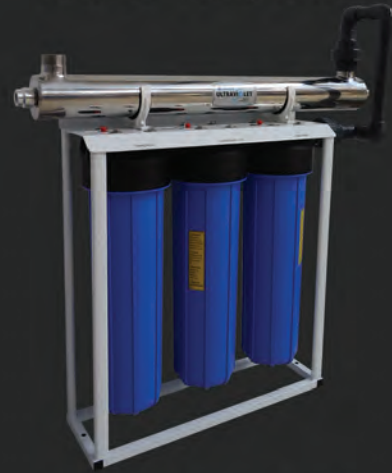
4 Stage Filtration Unit