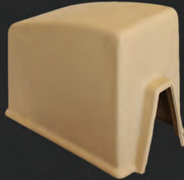
RainCell™ Pump Cover