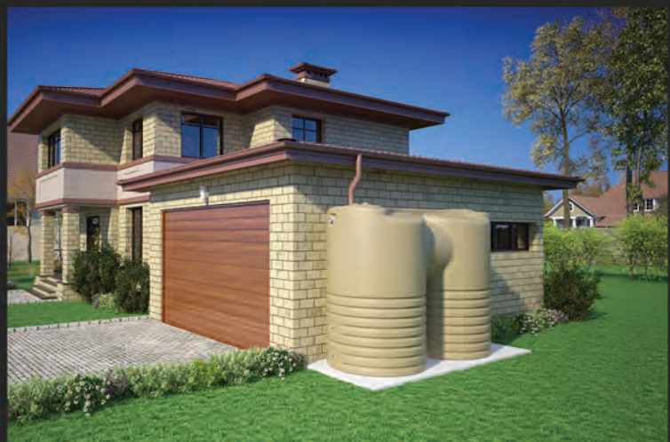
5000lt RainCell™ Mega Tank