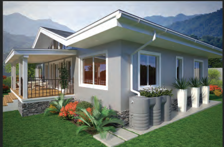
1100lt Raincell™ Planter Tank