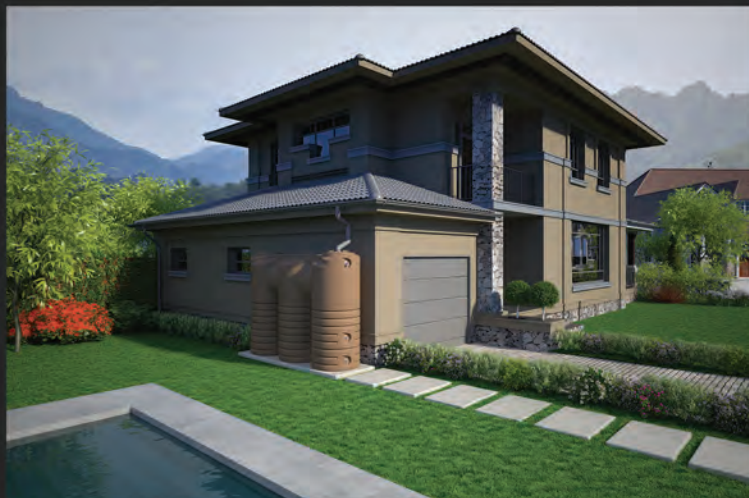
2500lt RainCell™ Tank