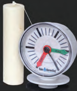
Next Gen Tank Gauge