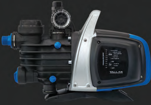
Tallas EBoost Domestic Pump

Please visit our website for our full range of accessories www.urbanrainsystems.co.za