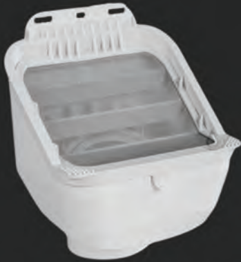
RainHead - Leaf Eater